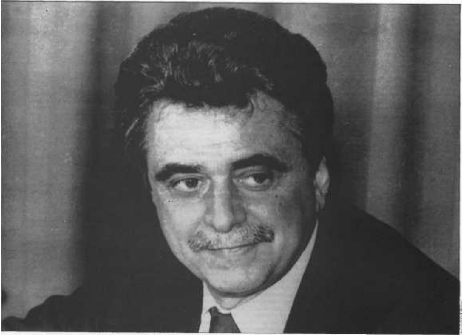
Achille Occhetto was elected general secretary of the PCI two years ago. He is 53 years old