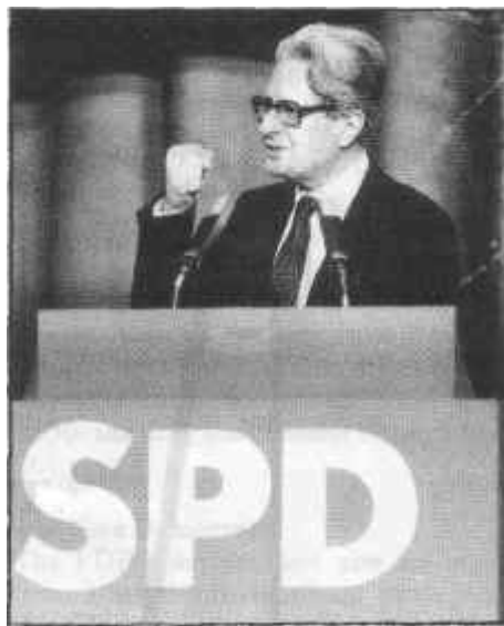
Hans-Jochen Vogel, defeated leader of West Germany's Social Democrats

The economic situation is aggravated by falling levels of new investment, a slowness to move into the most advanced technologies and an increasing national debt (currently well over 300 billion DM). The negative growth of national product in the last two years has added to the general failure of business confidence. In this climate, the CDU electioneering message