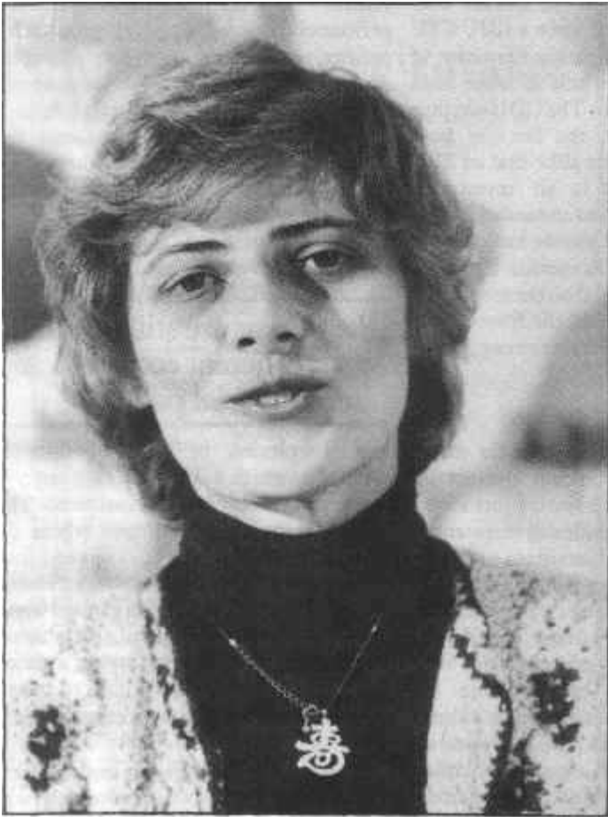
Petra Kelly of the Greens