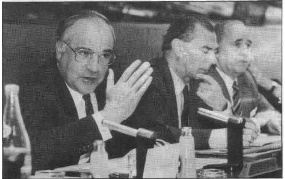
West German Chancellor Helmut Kohl

It seems certain that the census will be used to facilitate the recently stated CDU