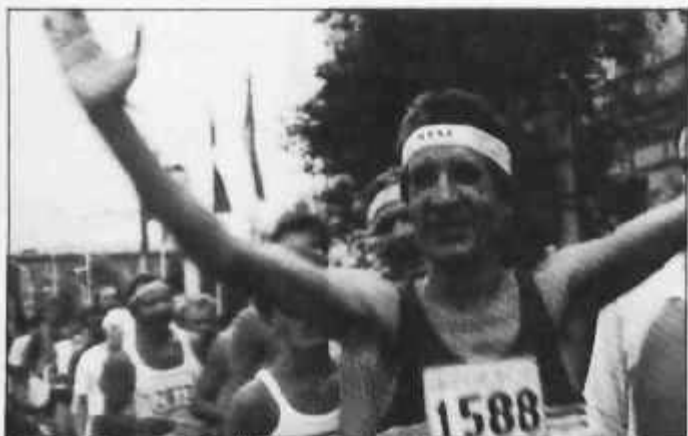
Our marathon runner at Omsk, Siberia, August 1991

7-15 days with a stay in Moscow or Kiev followed by a cruise in a large river liner through the ancient cities of the Golden Ring, and the Upper Volga, or the cities and scenic sites of the Ukraine, to Odessa. Various dates to late October from £550 (sharing twin cabin with bath).