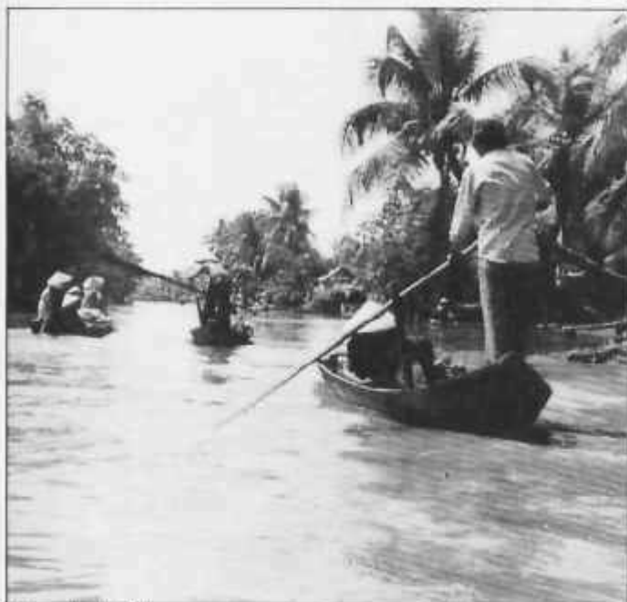
Mekong Delta, Vietnam