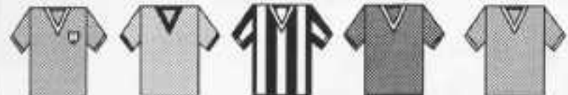
Leeds United - royal blue with gold V-neck, embroidered badge. As worn by John Charles.