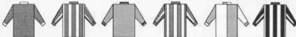
Red with white collar & cuffs, as worn by George Best & Bobby Charlton.