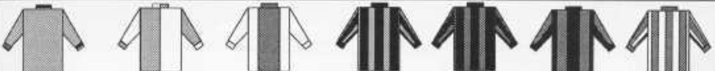
Ebenna style - Brightest Green with red, white & blue collar & cuffs.