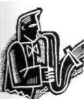
All that jazz p36

Cover Design: Pearce Marchbank