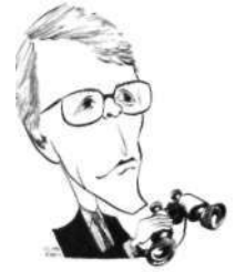
The new Tories p14