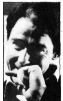
Porritt's progress p6