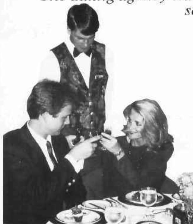
PS: A service which you would expect from the Best

The dating agency with one priority – and that is to serve you