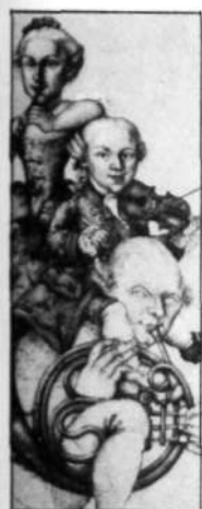
Images of Mozart p8