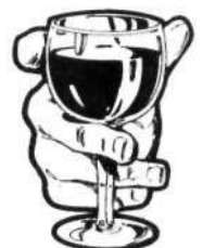
New year's resolutions p48