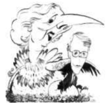
The end of an era p14