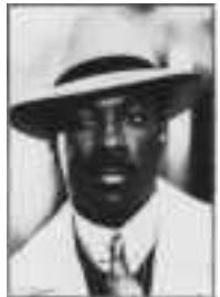
Eddie Murphy: In the money p8

Coming next month: Interview with Czech economic supremo, Valtr Komarek, Dick Hebdige on the Sundays, World Cup Special, Beyond the avant garde June issue on sale: Wednesday May 23rd