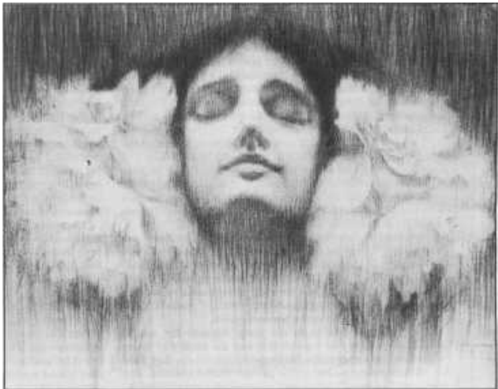
Ferenc Helbing, Dream , c.1900, Hungarian National Gallery

A celebration of the fine and applied arts and architecture in Hungary at the turn of the century, including paintings, graphics, sculpture, furniture, stained glass, porcelain, costumes and jewellery. A Golden Age traces the move from the academic styles of the late 19th century to the development of Hungarian Art Nouveau with its particular fusion of modernism and folk traditions.