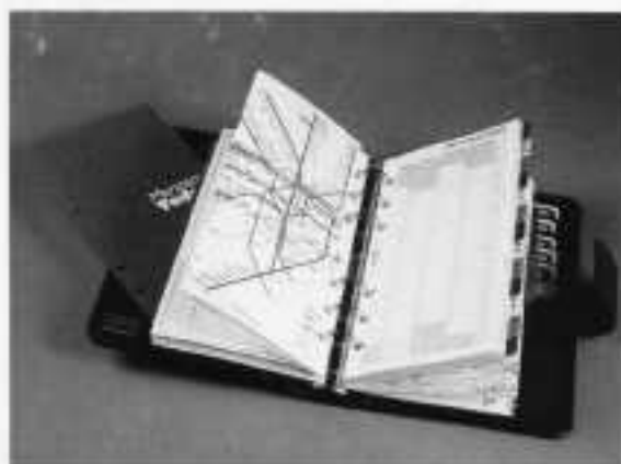
3. PERSONAL ORGANISER In leather, includes diary, year planner, address book, notebook, maps, pen-holder and credit card pockets. Featuring Marxism Today frontispiece and logo embossed on an inside cover. Also available in black vinyl.