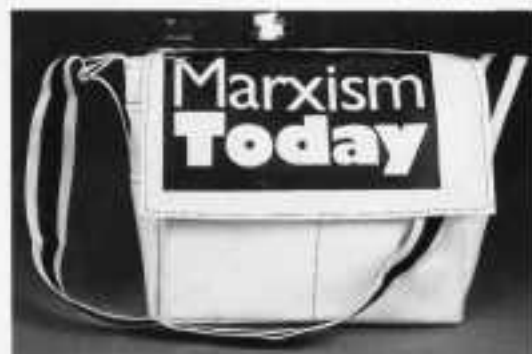
8. SATCHEL Waterproof and fluorescent, incorporating five pockets and adjustable shoulder strap.