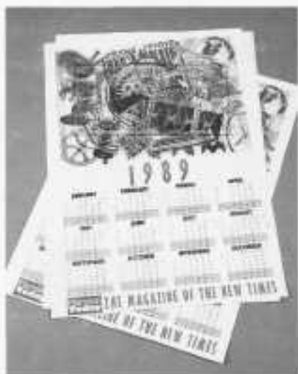
2. CALENDAR Year at a glance with plenty of space to fill in appointments, birthdays, events etc. Poster size.