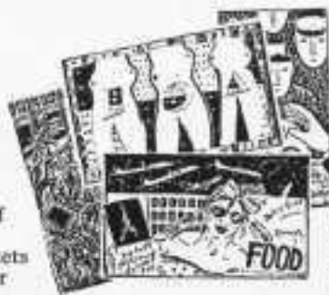
9. GREETINGS CARDS Four original illustrations from Marxism Today . Blank inside for your greetings. Available only as a set of four with envelopes.