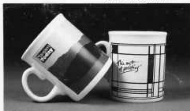
5. NEW TIMES MUG Features our October cover design by Jan Brown.