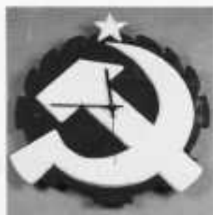
1. WALL CLOCK Hand-crafted in wood, quartz mechanism with wall mounting.