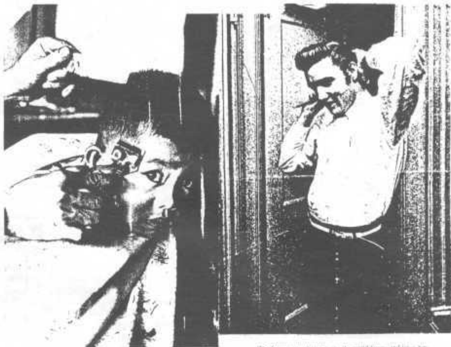
The Cornflake Shop stands in the world famous and busy city.

ALPHASON, AUDIO TECHNICA, CAMBRIDGE AUDIO, CANTON, COUNTERPOINT, D.N.M., EPOS, GOODMAN, HARMAN KARDON, HELIUS, KOETSU, MANTICORE, MONITOR AUDIO, MYST, MORDAUNT-SHORT, NAGAOKA, NAKAMICHI, ONIX, ORANGE AUDIO, ORTOFON, P.S. AUDIO, REGA, ROKSAN, ROYD, S.M.E. NAIM, SUPEX, VAN DEN HUL, WHARFEDALE, YAMAHA,