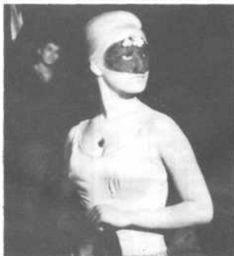
Captious summer, Czechoslovakia

Korean War Unshelved Russian Films Films From Argentina, Part II Monroe and Her Generation