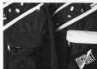
Customised Knap-Sack available in red & black or yellow & black. £11.99

Customised Flying Jacket (L/XL) £35.99 Baseball Cap. £6.99