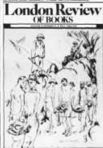
EDWARD SAID: SAJJAD; PHELP WITH: MALANAD

Superficial journalism aids and abets establishment control. There is an urgent need in Britain today for more detailed and informed comment on the complex conditions of modern existence. The LRB continues to try and help fill this need. For depth and authority of analysis, range of subject matter and sheer volume of published output, there is no literary paper in Britain to compete with the LRB. There ought to be, but there isn't.