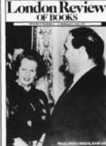
SHARDEPARK HORN; THATCHER: STANBELL

The London Review of Books is not a light journal. Some would say it was positively formidable. Certainly, it assumes people want substance for their money. We are sure that readers of Marxism Today will enjoy and value the LRB. That's why we are offering you the chance to take out a subscription with a free trial period of 3 months (6 issues). We think you'll become addicted. If you don't we'll give you your money back in full at any time in the trial period.