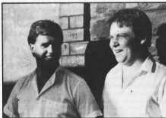
Communist Party branch collecting food in North London.

It was communist women and miners who first visited Greenham to build the links between the miners and the peace movement. Communist women have been active in 'Women against Pit Closures' and communist trade unionists have pushed for solidarity from other unions.