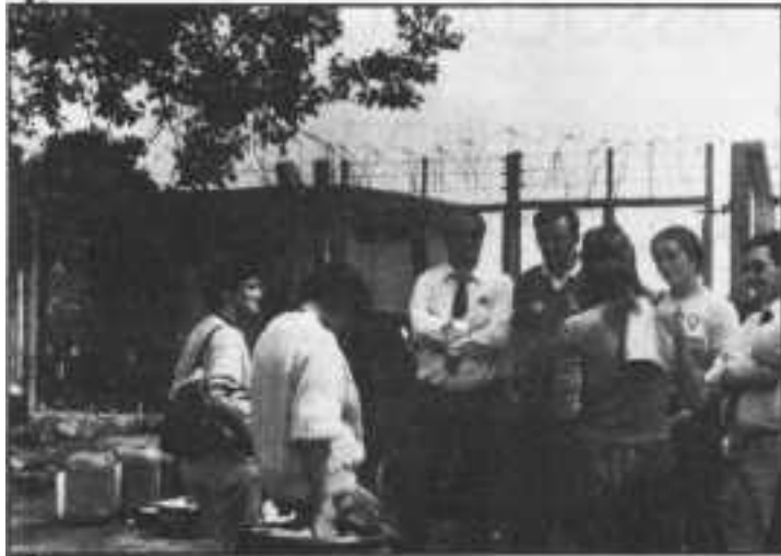
Communist Party branches from all over Britain have run street collections – taking the arguments to the public and collecting the food which is so urgently needed in the mining communities.