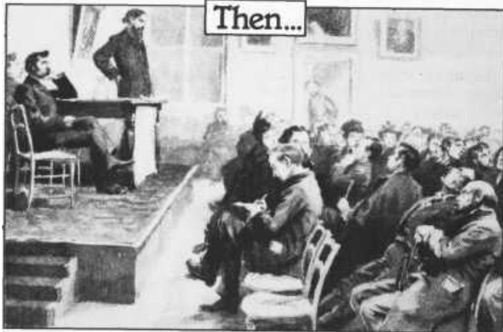
Meeting at Essex Hall, 1892