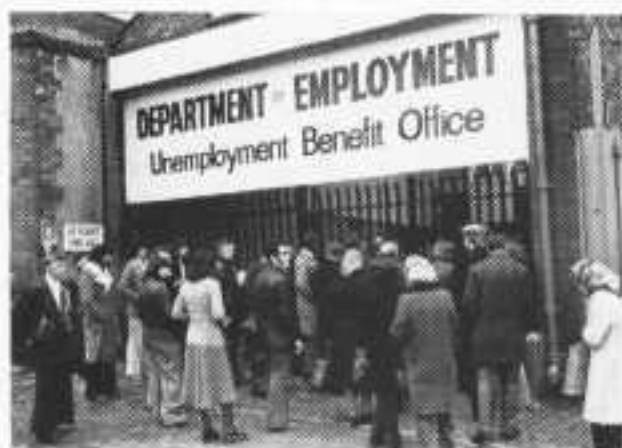
(John Sturrock, Report)

2 million unemployed in Britain. 7 million unemployed in the EEC. 331 million unemployed or without regular jobs in the Third World.